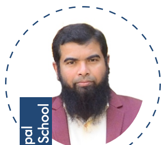
Principal Crescent School