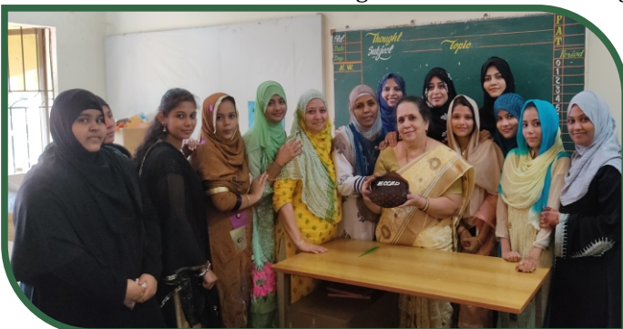
ECCED course students with the Course Director and other Faculty Members.