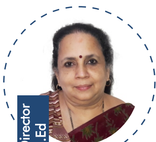
Course Director E.C.C.Ed