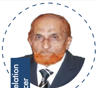
Public Relation Officer