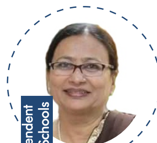
Superintendent Nursery Schools