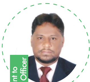
Assistant to Executive Officer