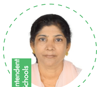
Asst. Superintendent Nursery Schools