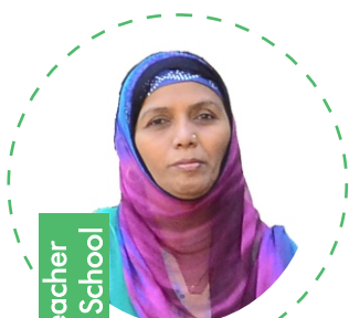
Head Teacher Crescent School