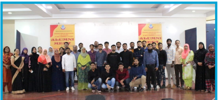
Alumni meet organized by Crescent English High School.