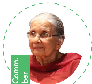
Advisory Comm. Member

A small body of determined spirits fired by an unquenchable faith in their mission can alter the course of history