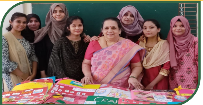
ECCED course students with their Projects.